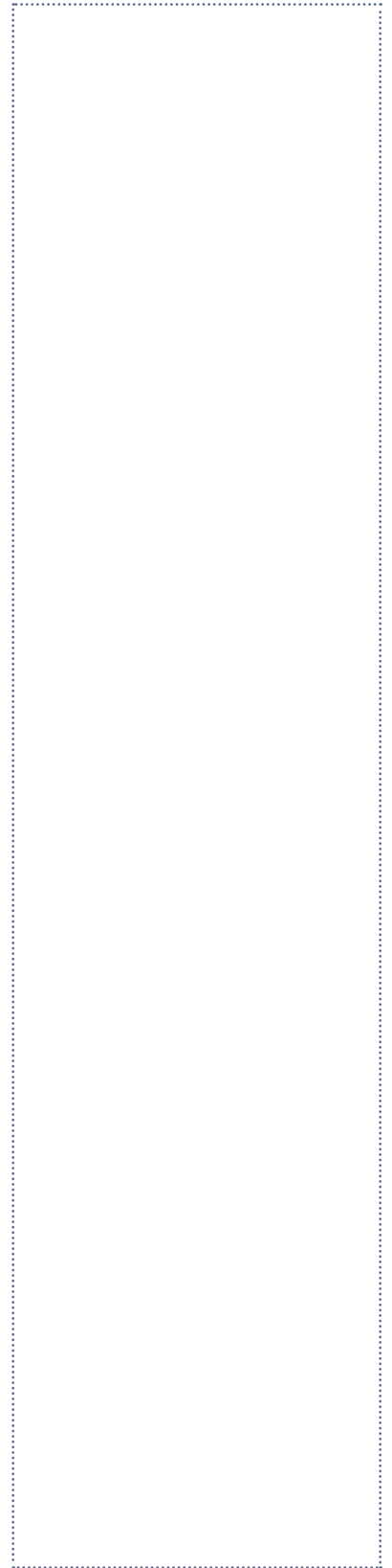
Bookmark Template Front