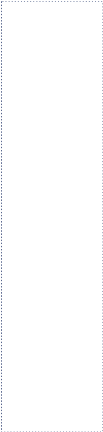
Bookmark Template Front